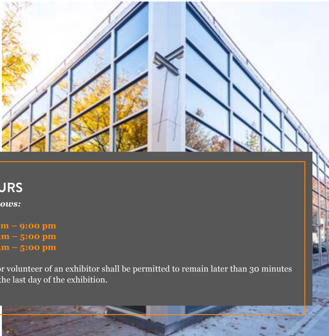
EXHIBIT DATES AND HOURS